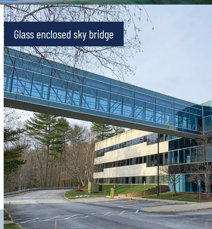
Glass enclosed sky bridge

Located immediately alongside Route 3, with quick connections to I-95 and I-495, the campus is ideally positioned for easy travel across eastern Massachusetts and southern New Hampshire. Enjoy the convenience of Burlington's amenities, just minutes away, but without the congestion or premium pricing.