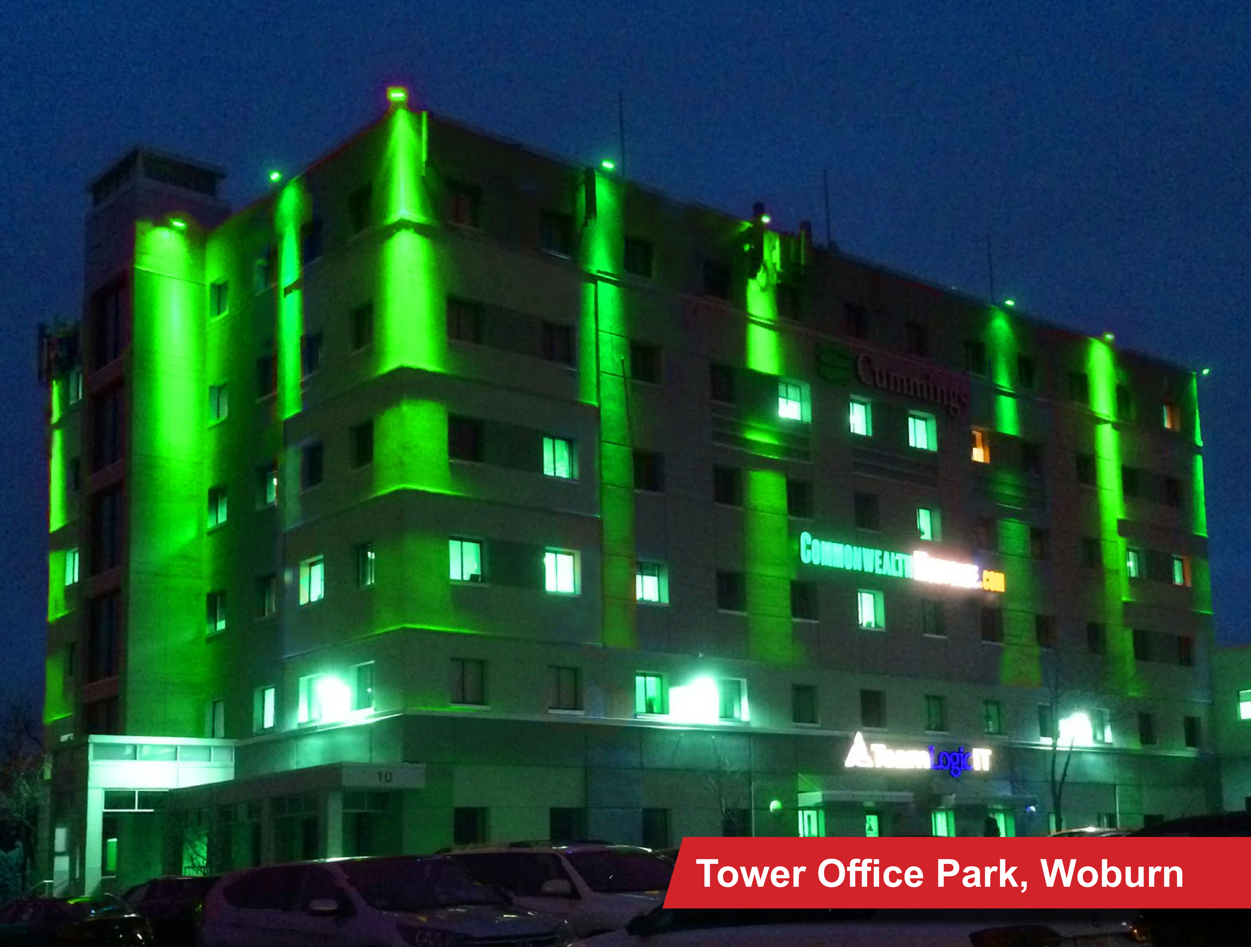
Tower Office Park, Woburn