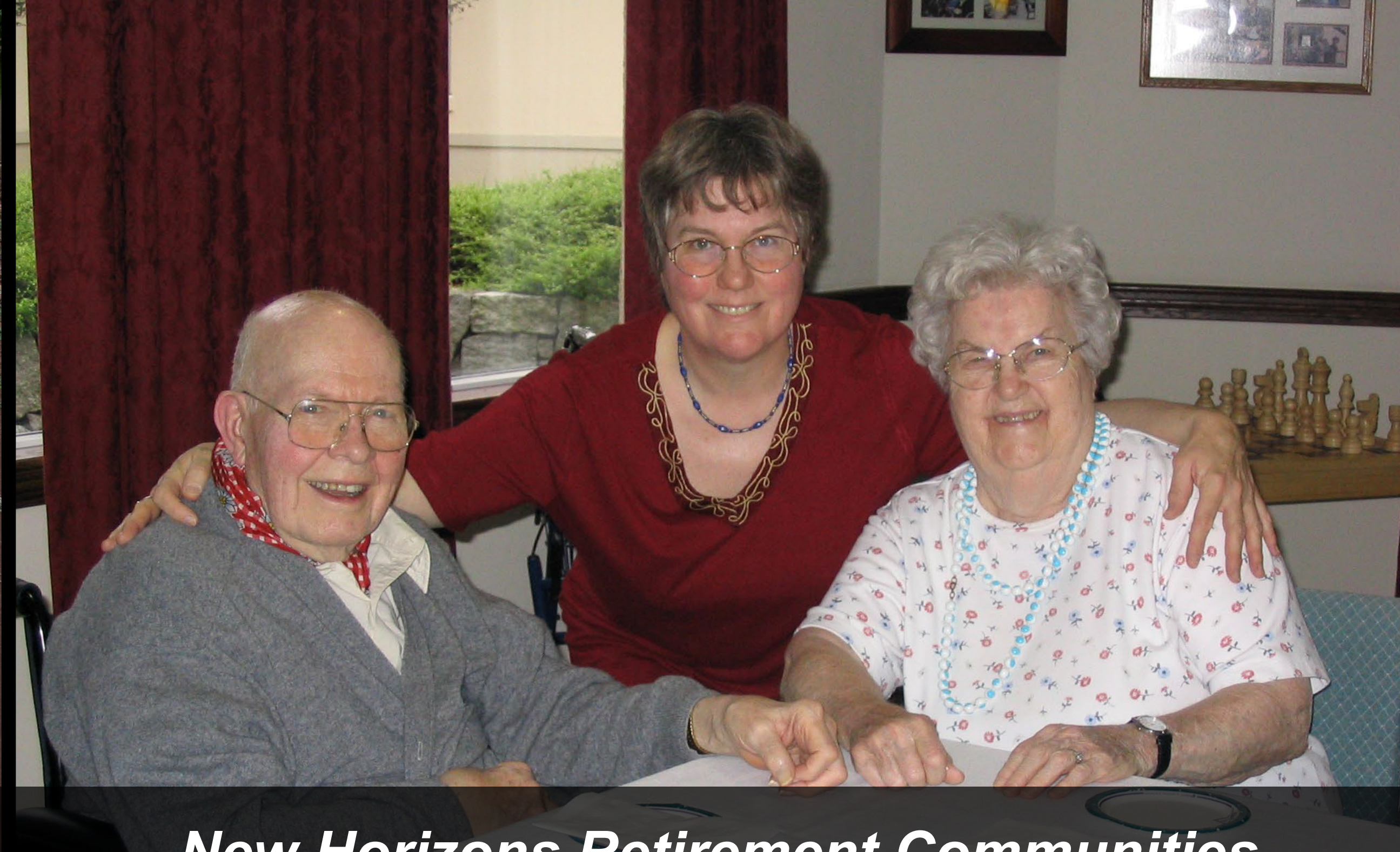
Institute for World Justice