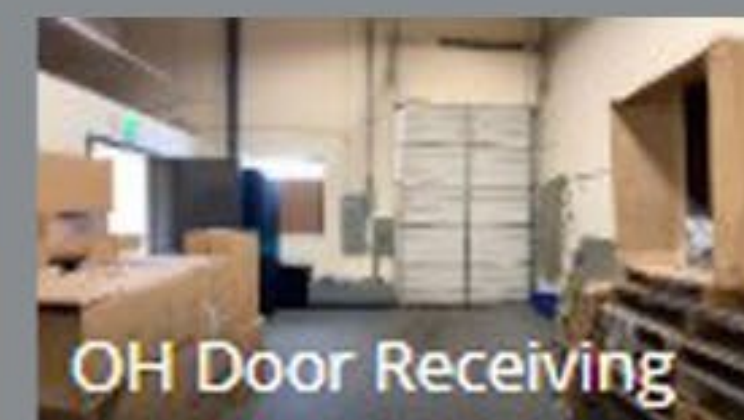
OH Door Receiving