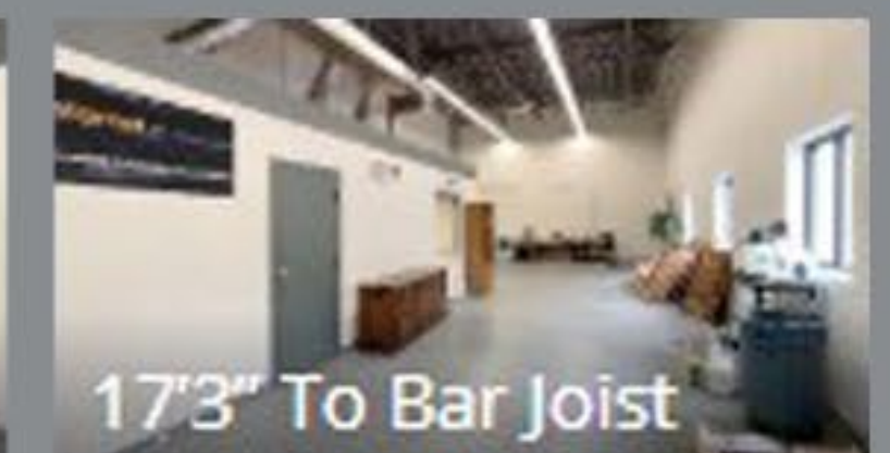
17'3" To Bar Joist