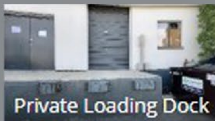
Private Loading Dock