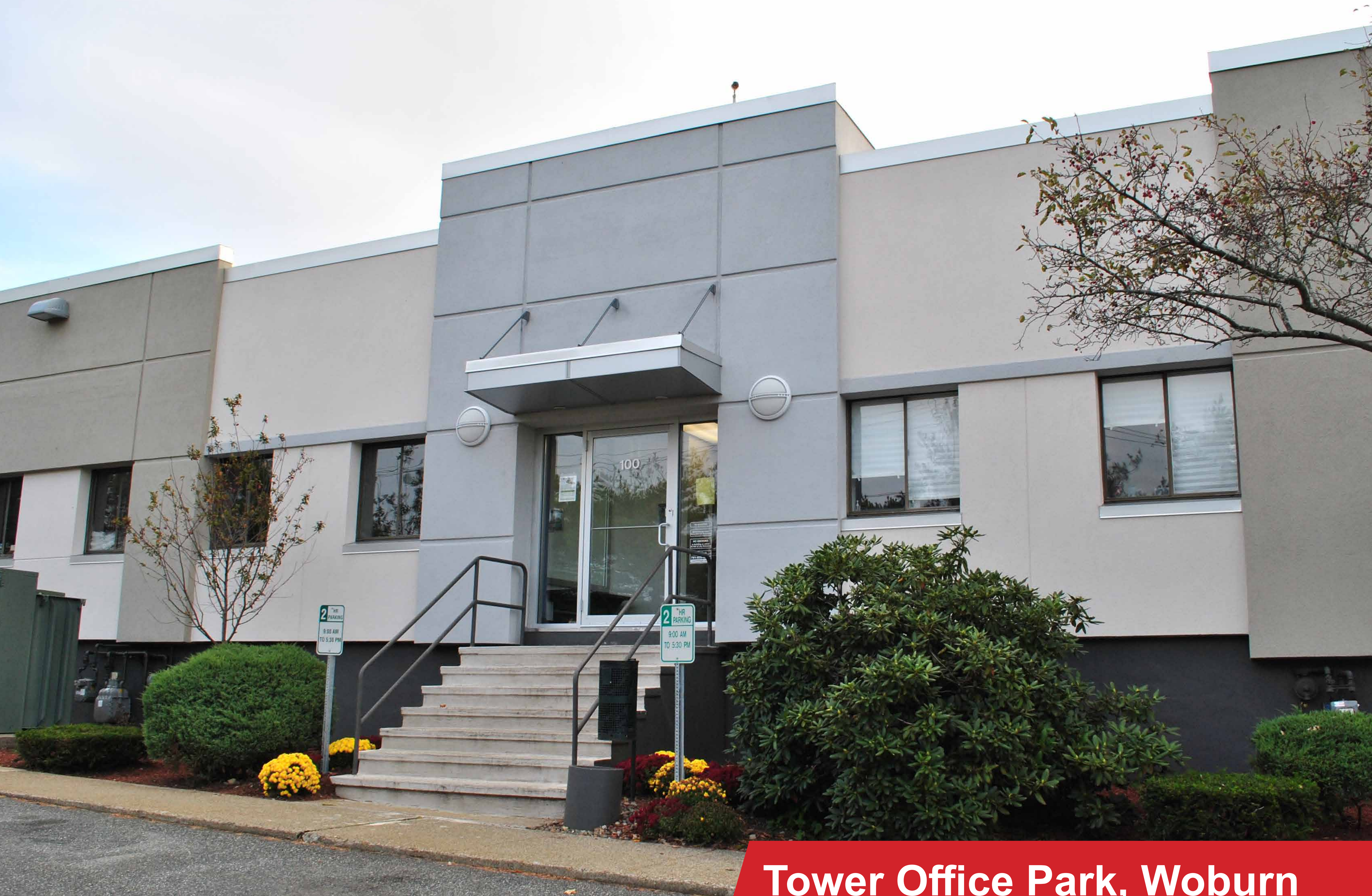
Tower Office Park, Woburn