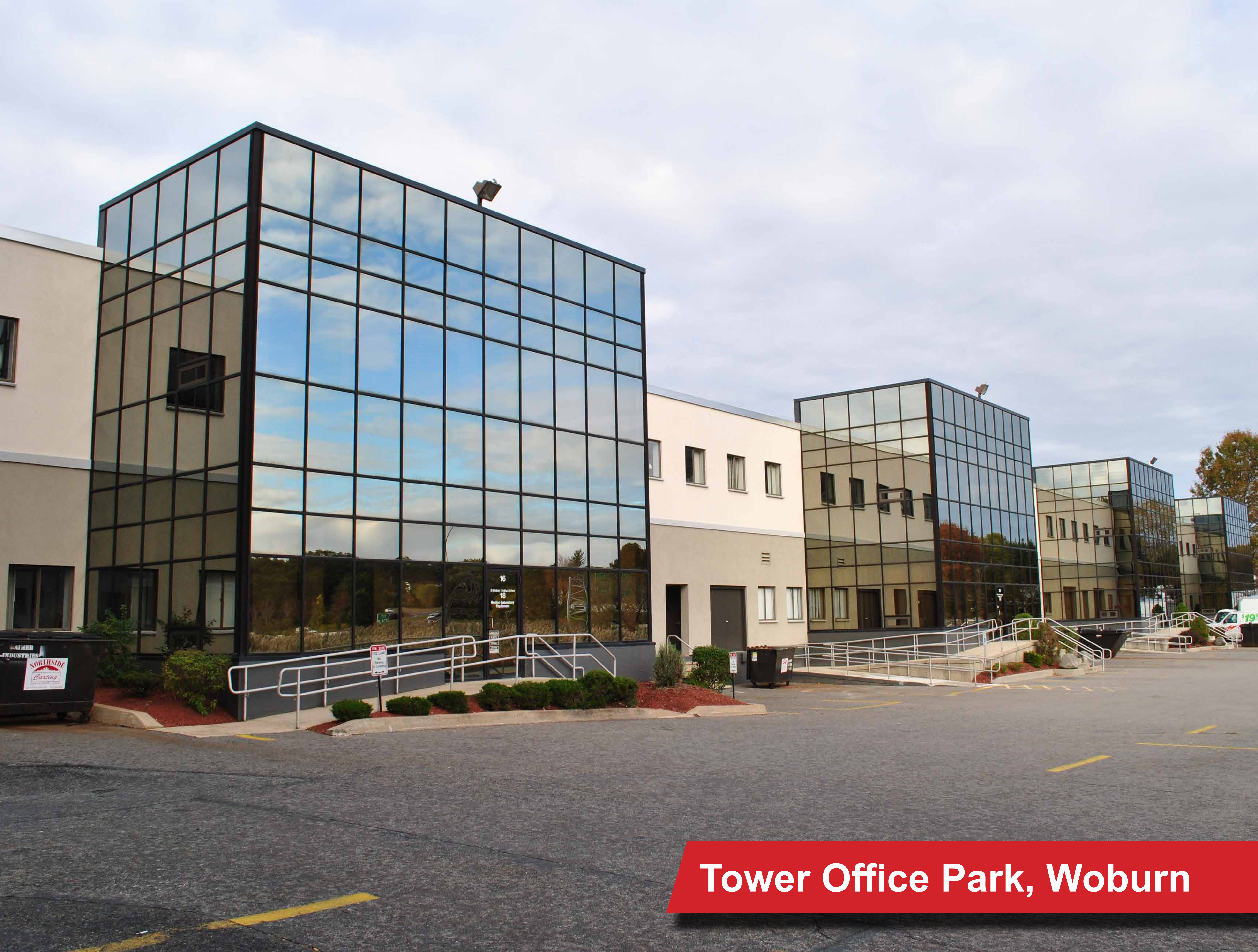
Tower Office Park, Woburn