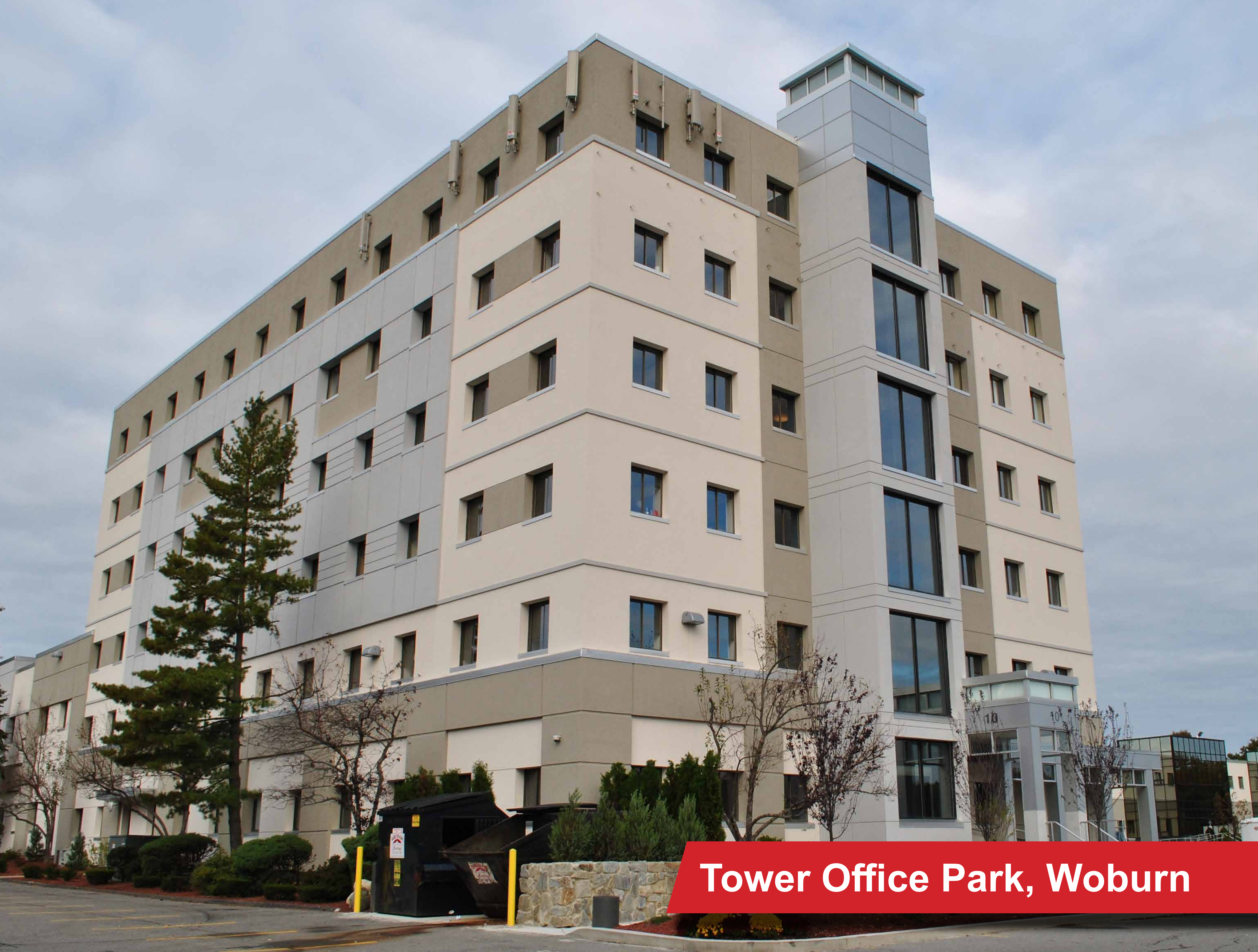
Tower Office Park, Woburn