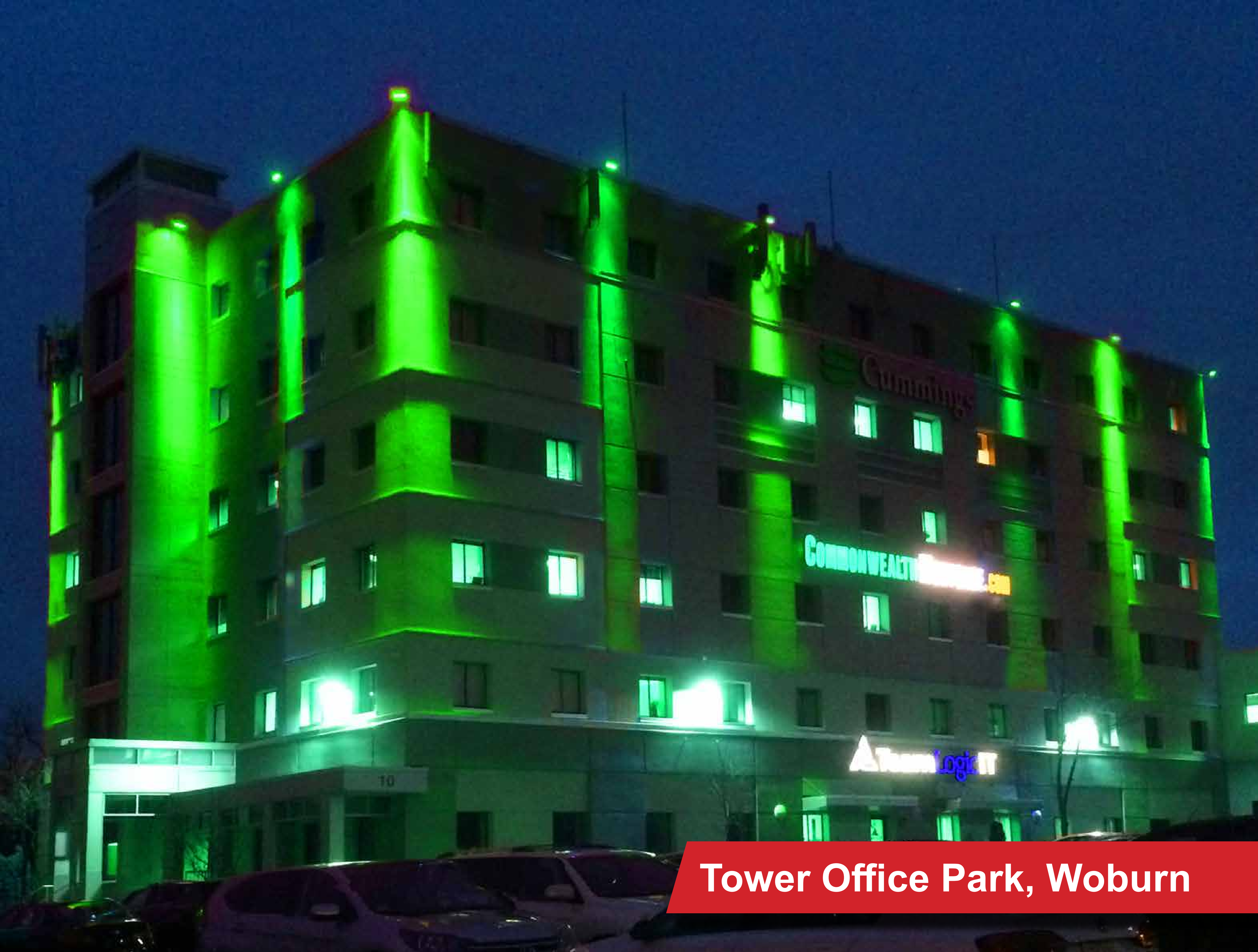
Tower Office Park, Woburn