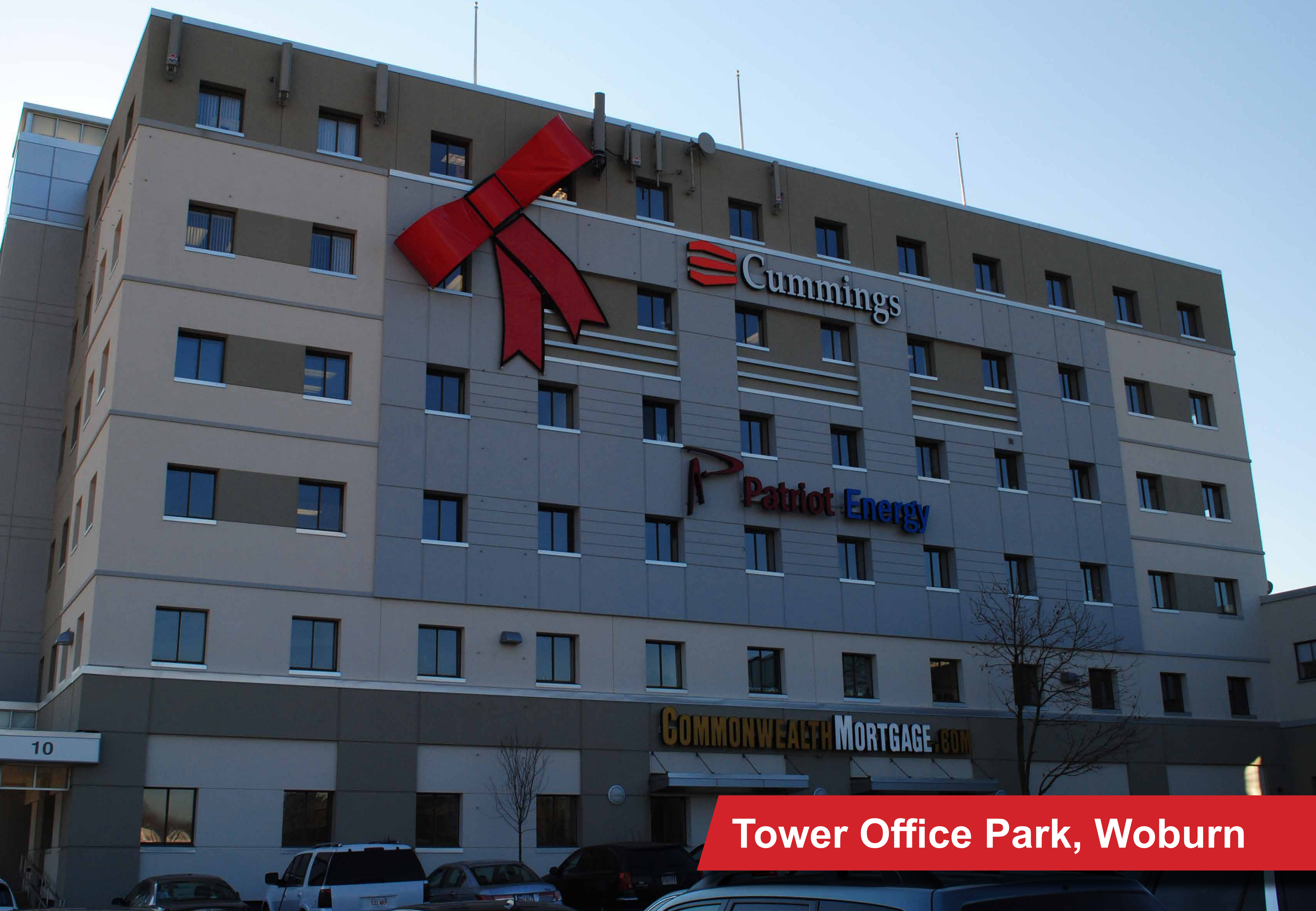
Tower Office Park, Woburn