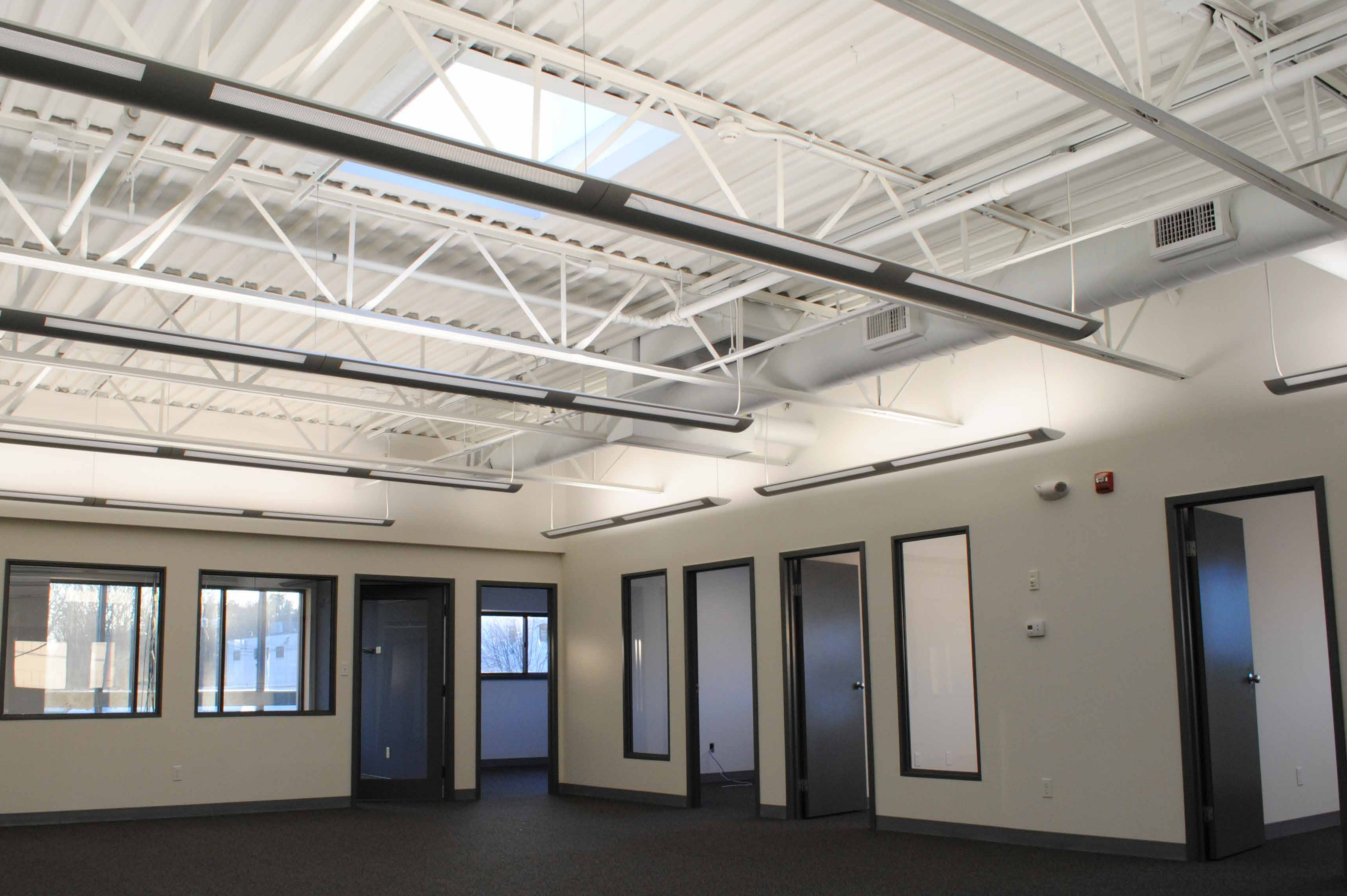
1 Merrill Street, Woburn