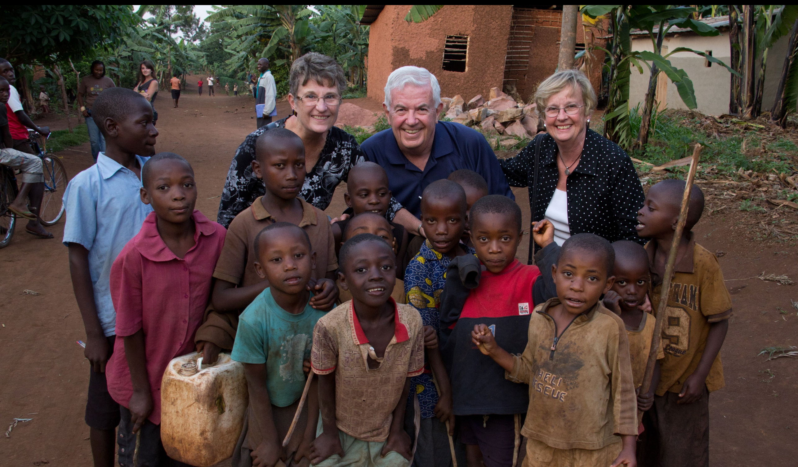
Institute for World Justice