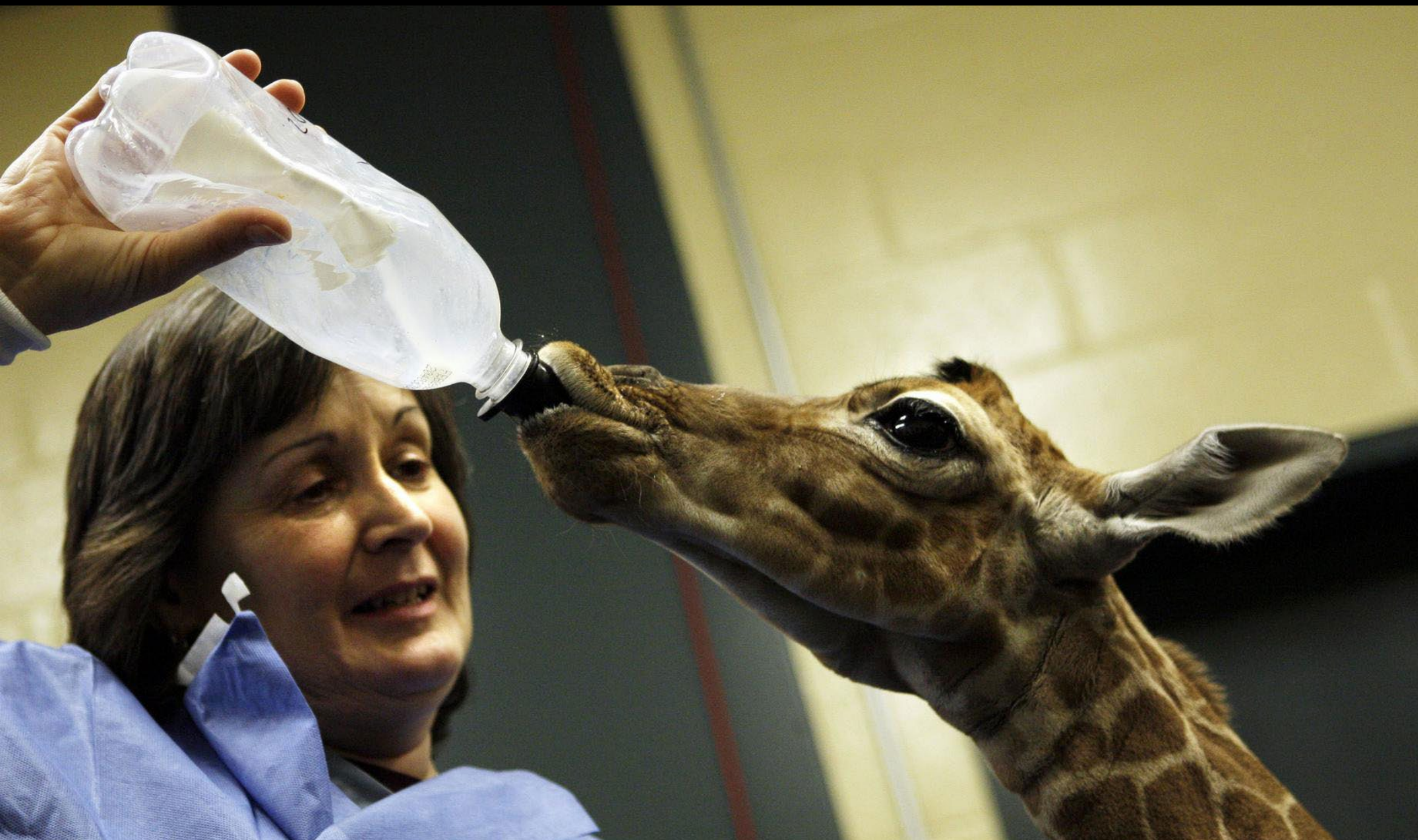
Tufts/Cummings School of Veterinary Medicine