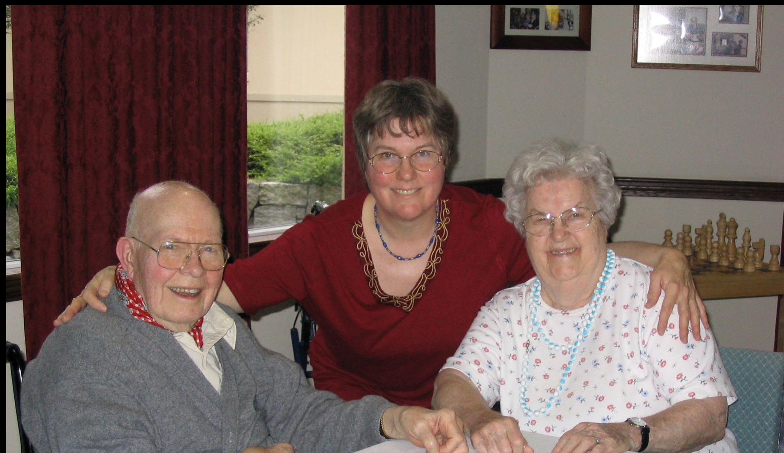
New Horizons Retirement Communities