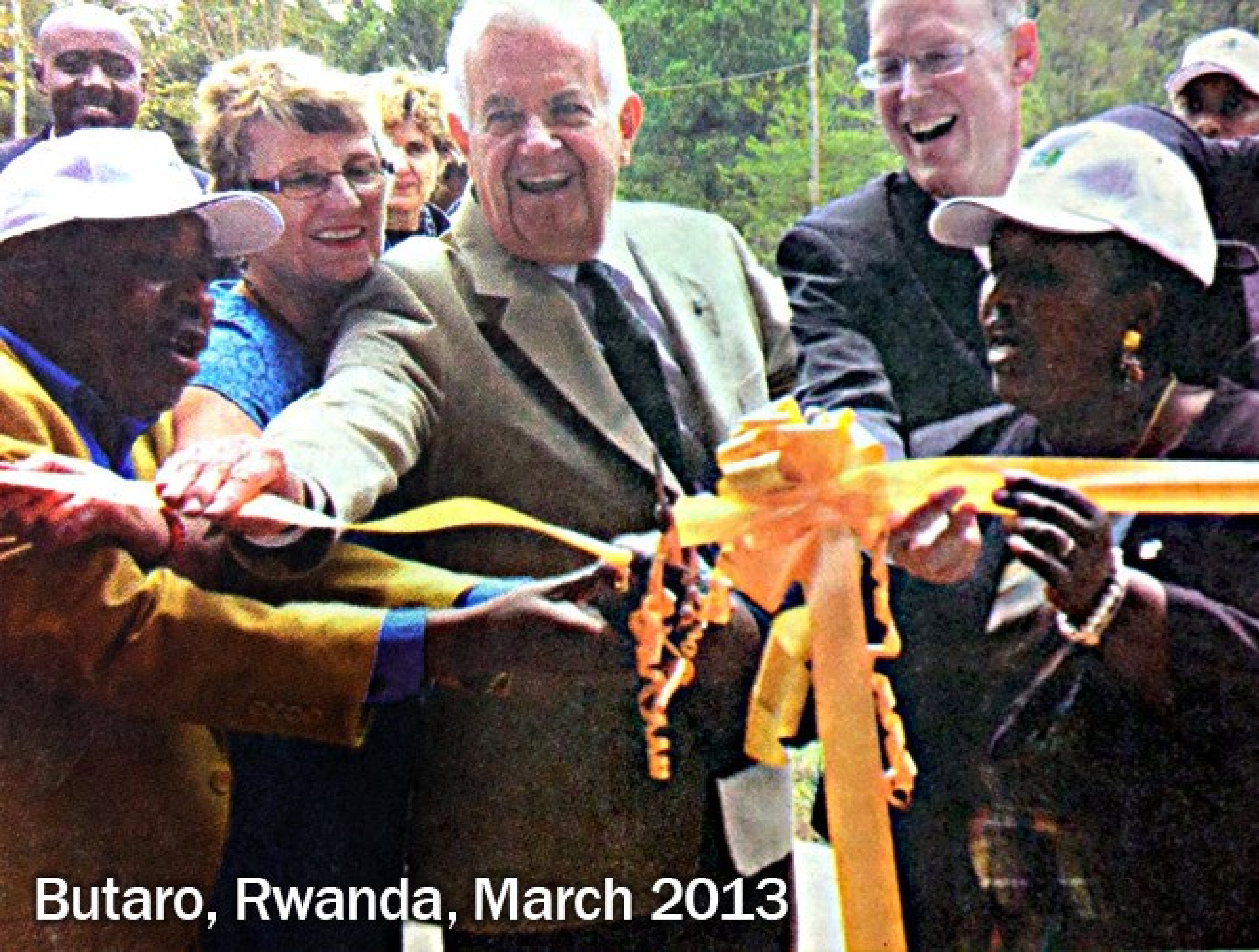
Butaro, Rwanda, March 2013