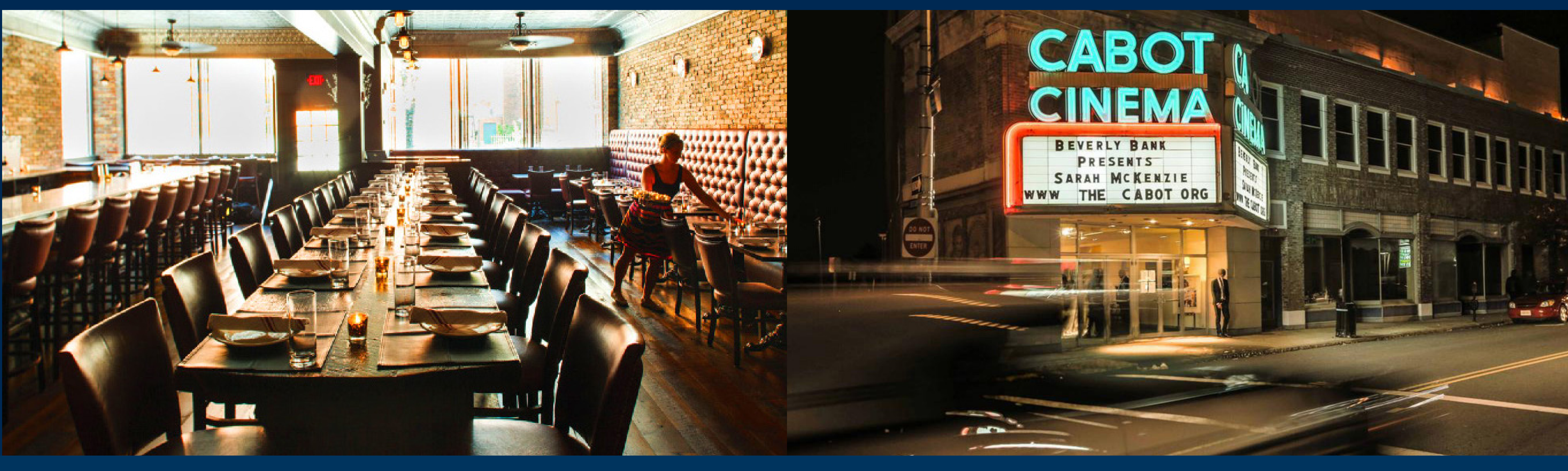
AMERICAN BARREL HOUSE