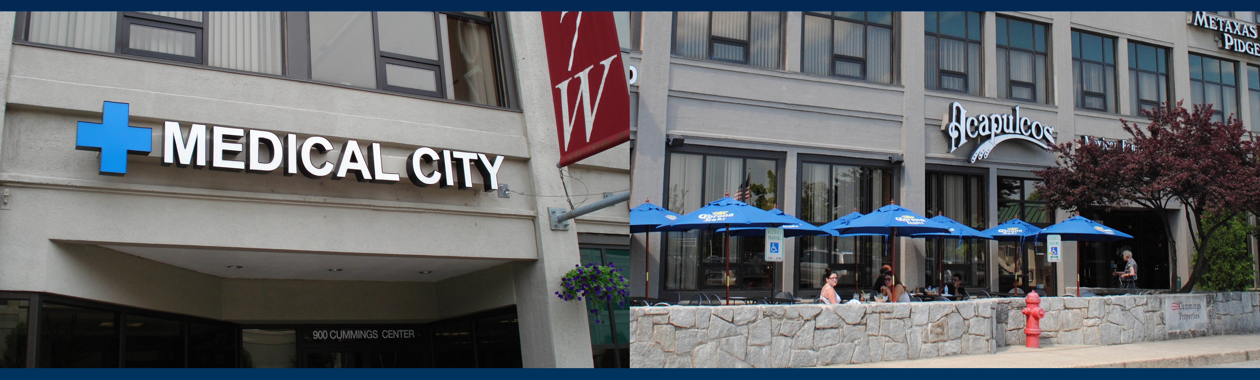
Numerous Medical Providers