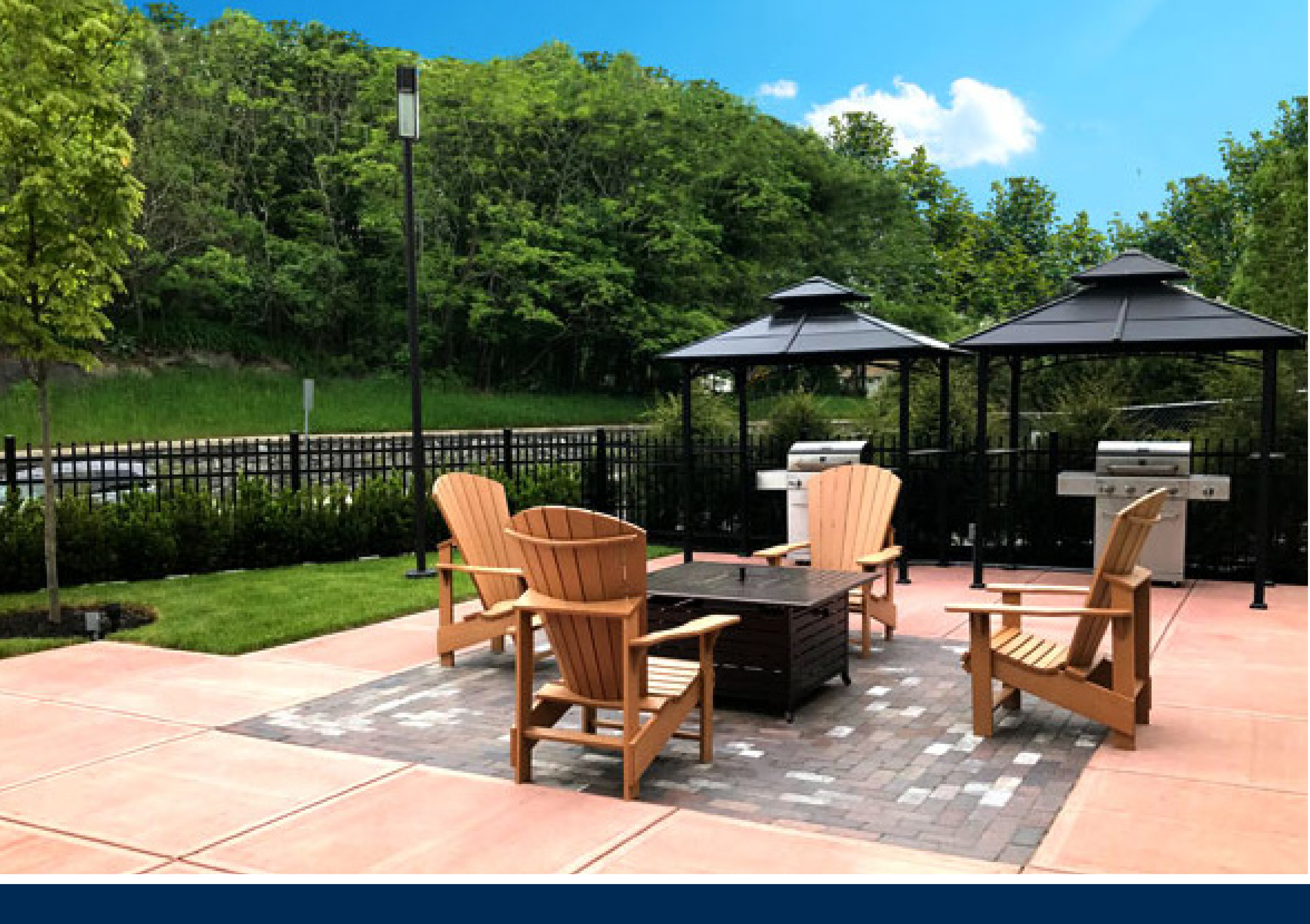
Experience care-free outdoor living as an Elliott Landing homeowner.