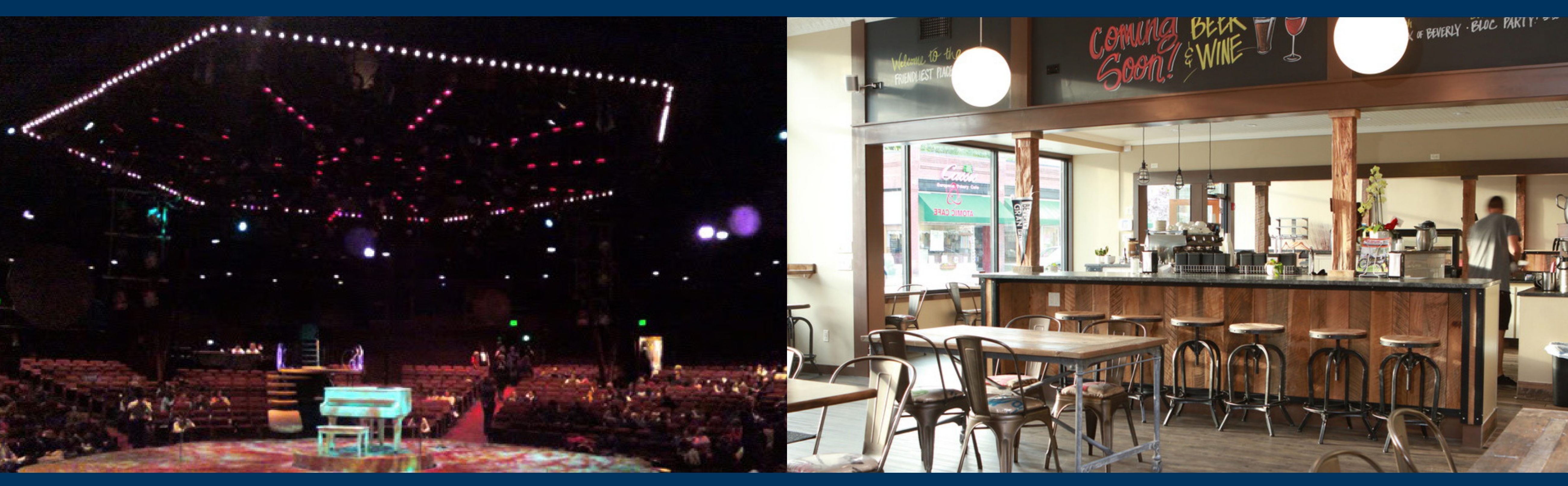
NORTHSHORE MUSIC THEATER