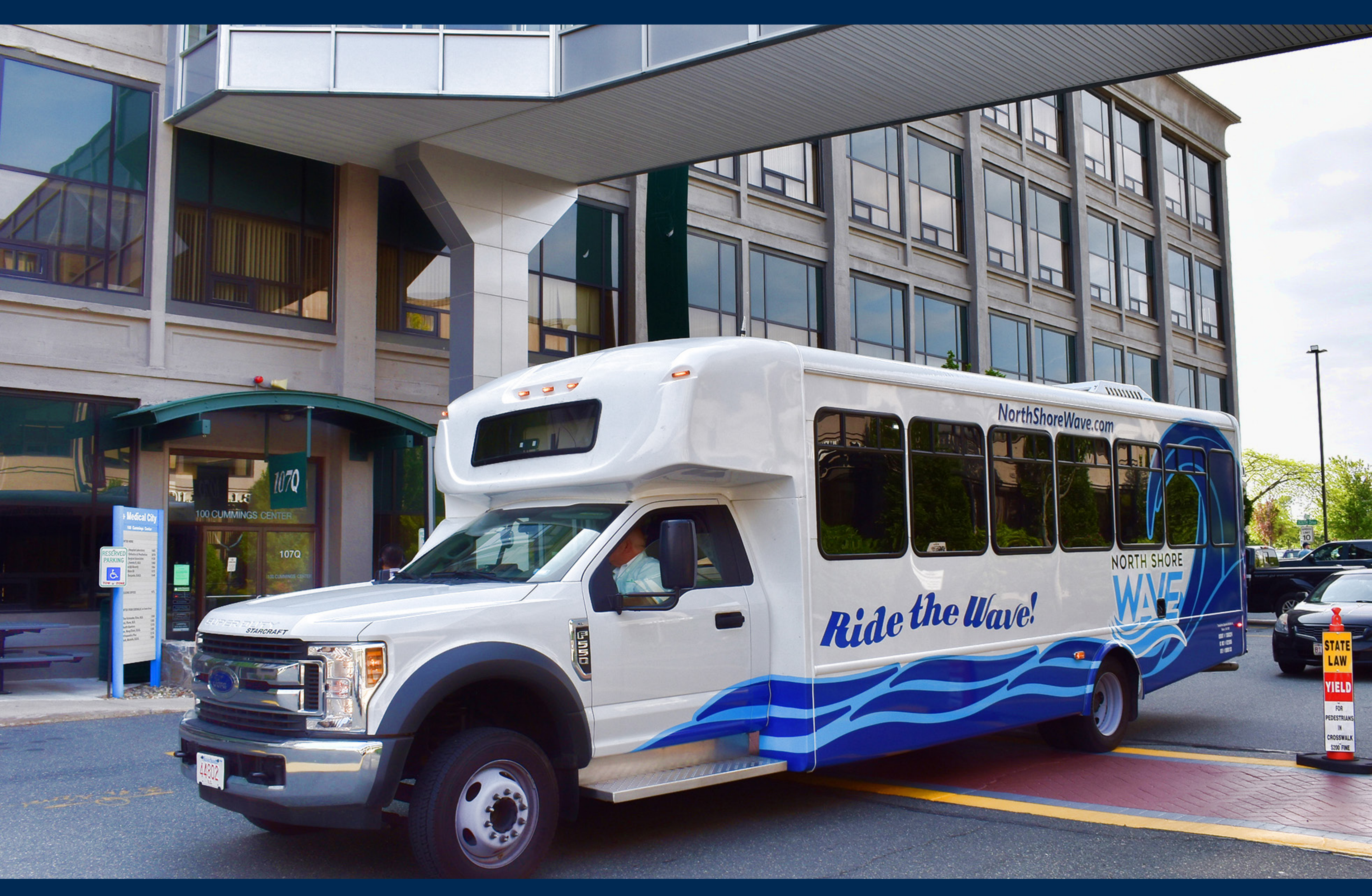
Ride the Wave - Free Shuttle Between Beverly Depot MBTA & Cummings Center