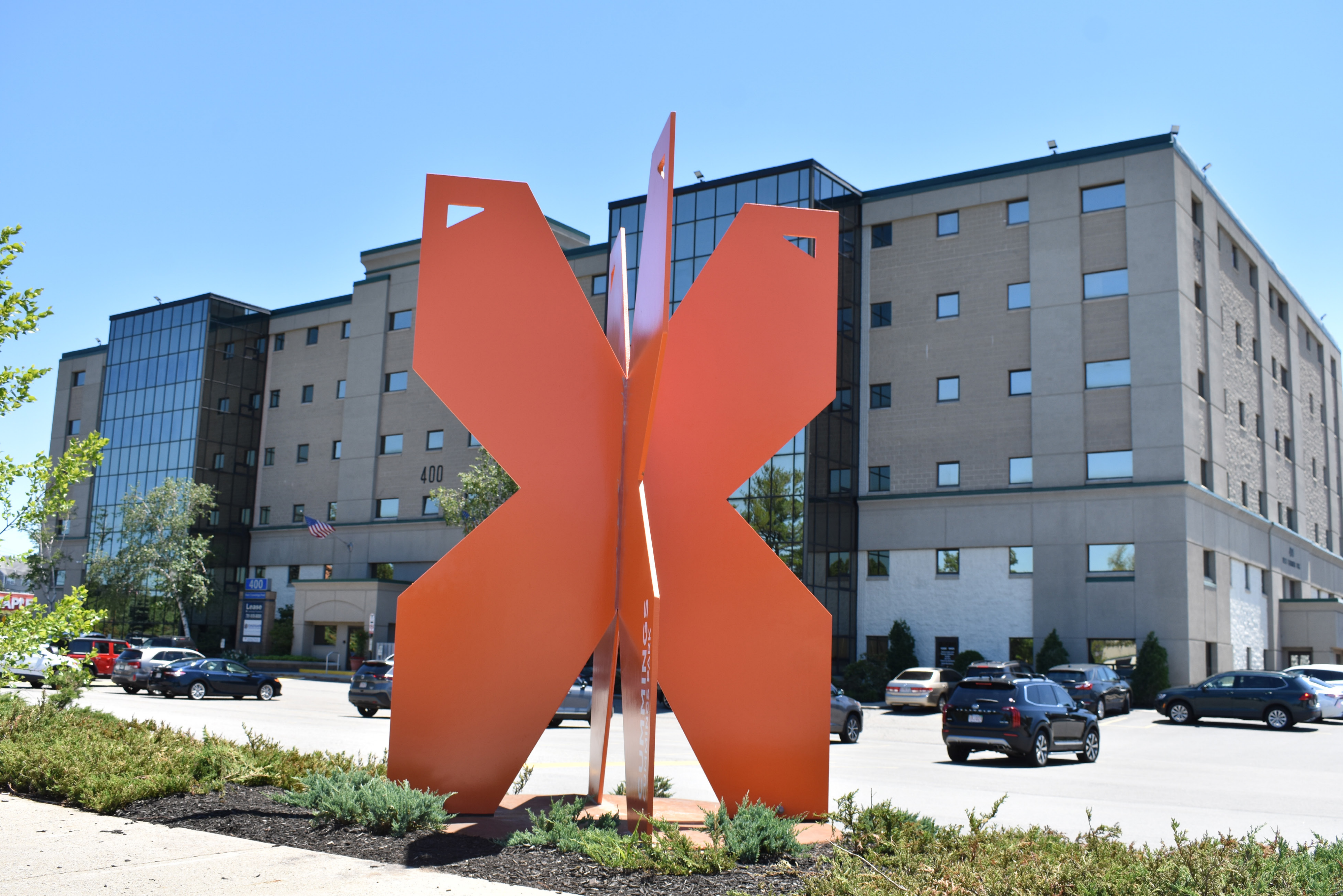
West Cummings Park, Woburn MA