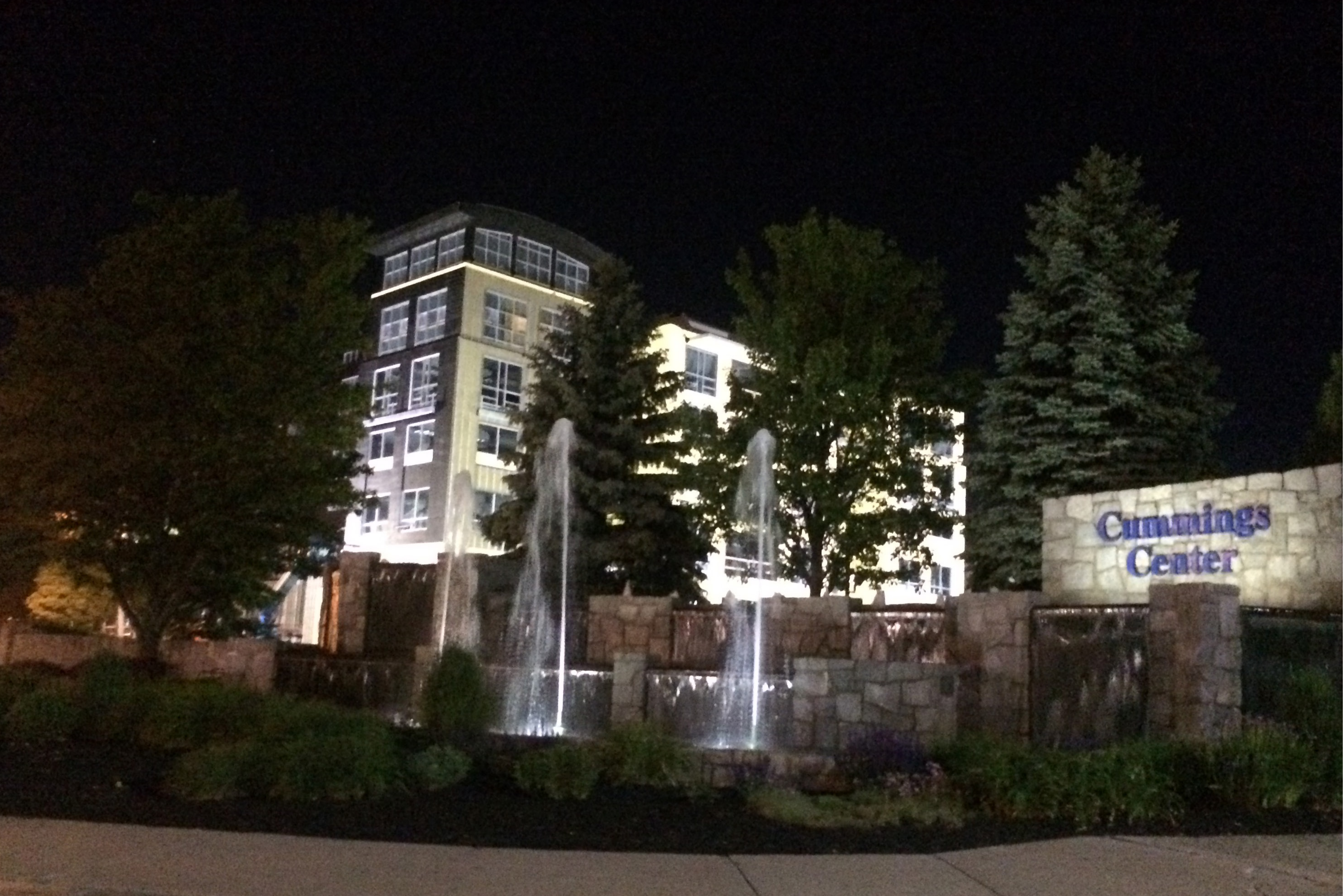
Cummings Center, Beverly MA