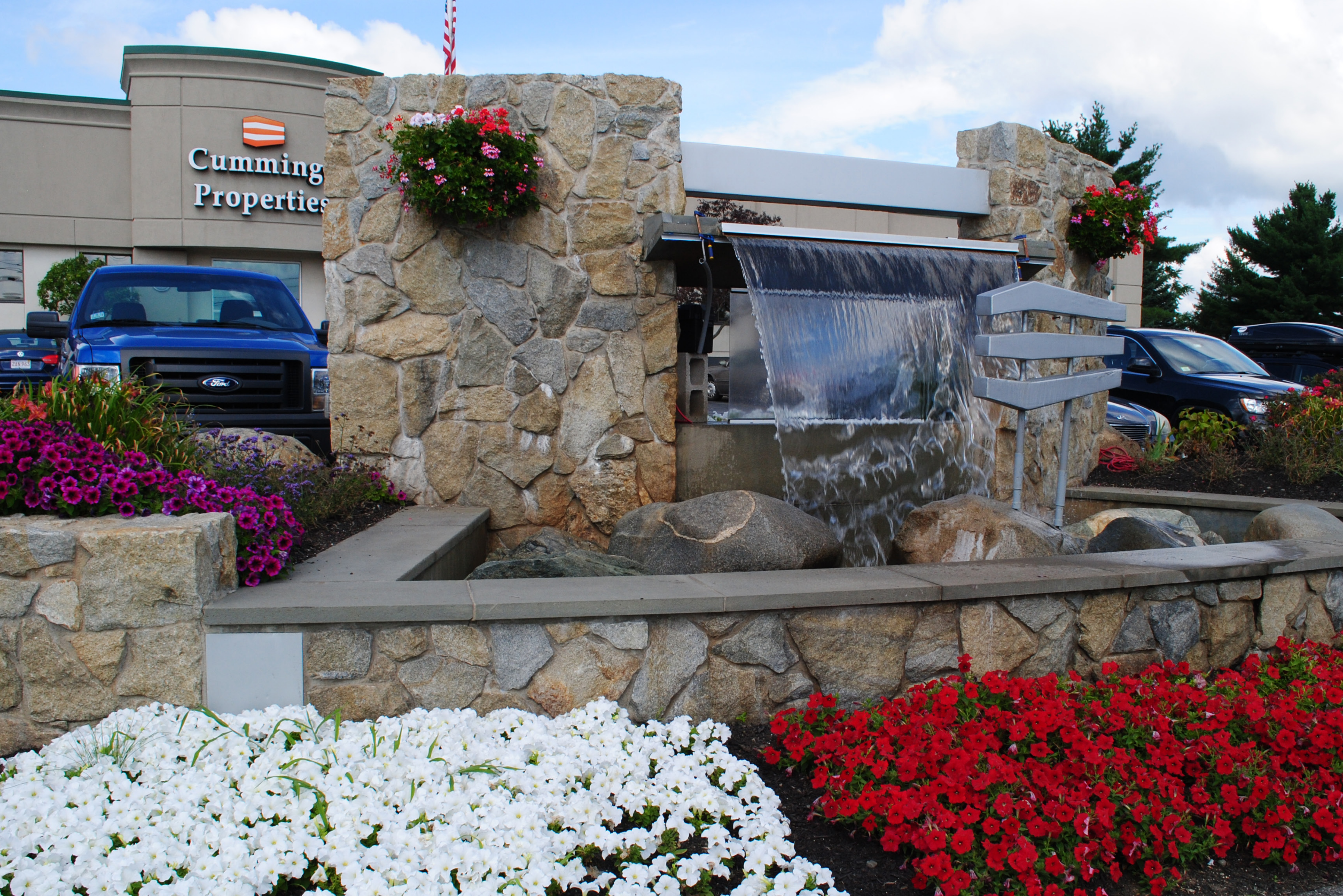
West Cummings Park, Woburn MA