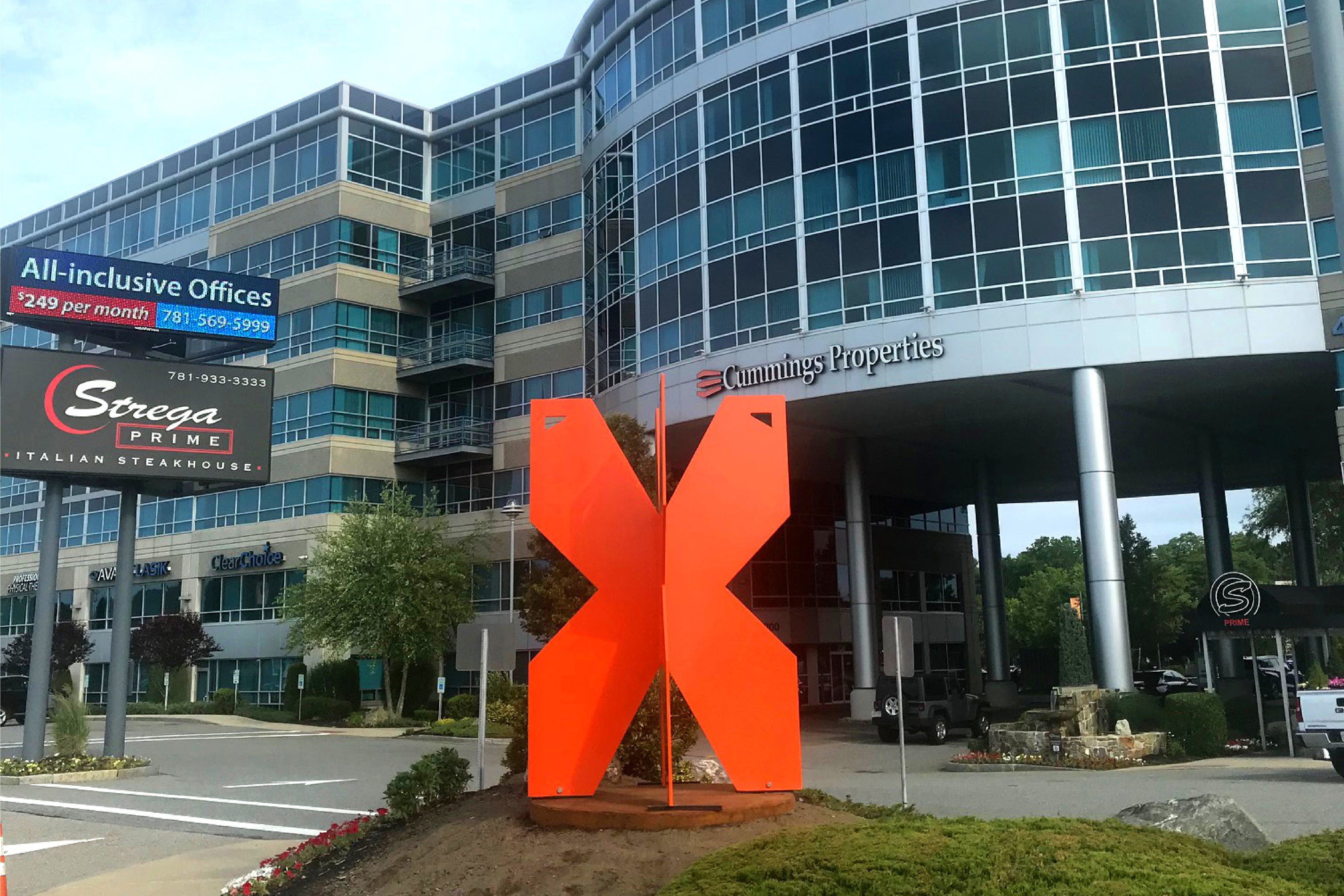
TradeCenter 128, Woburn MA