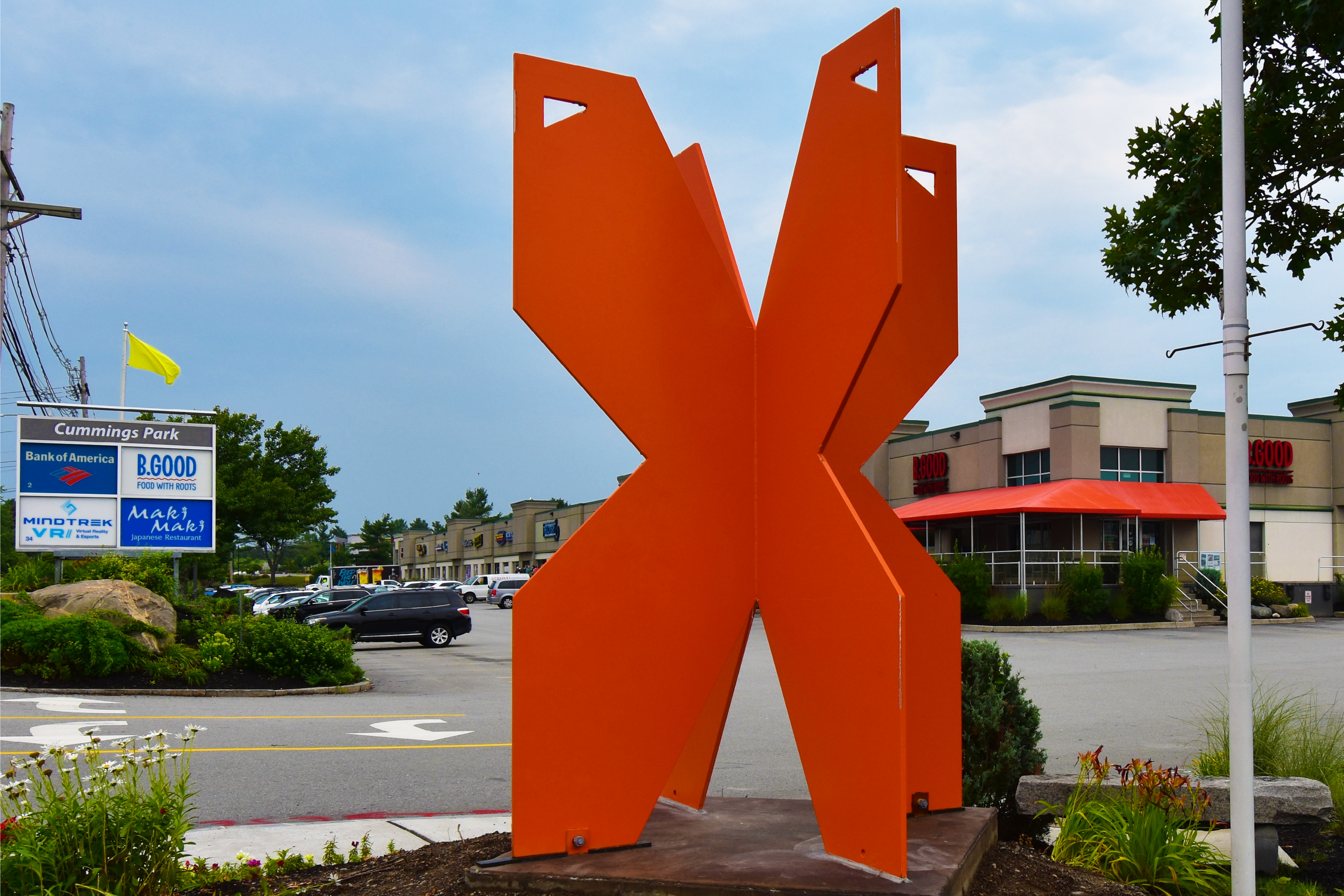
Cummins Park, Woburn MA