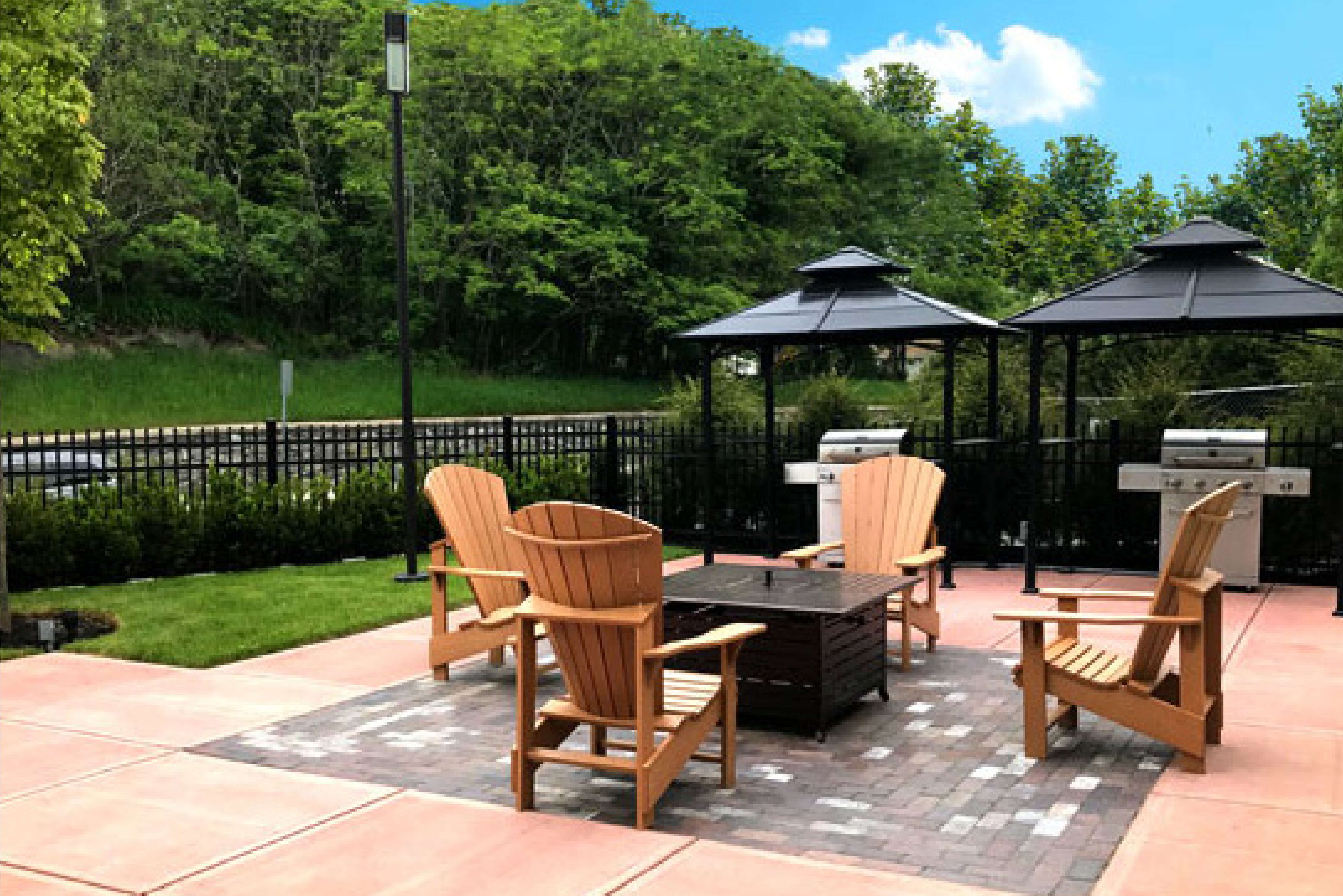
Elliott Landing, Beverly MA