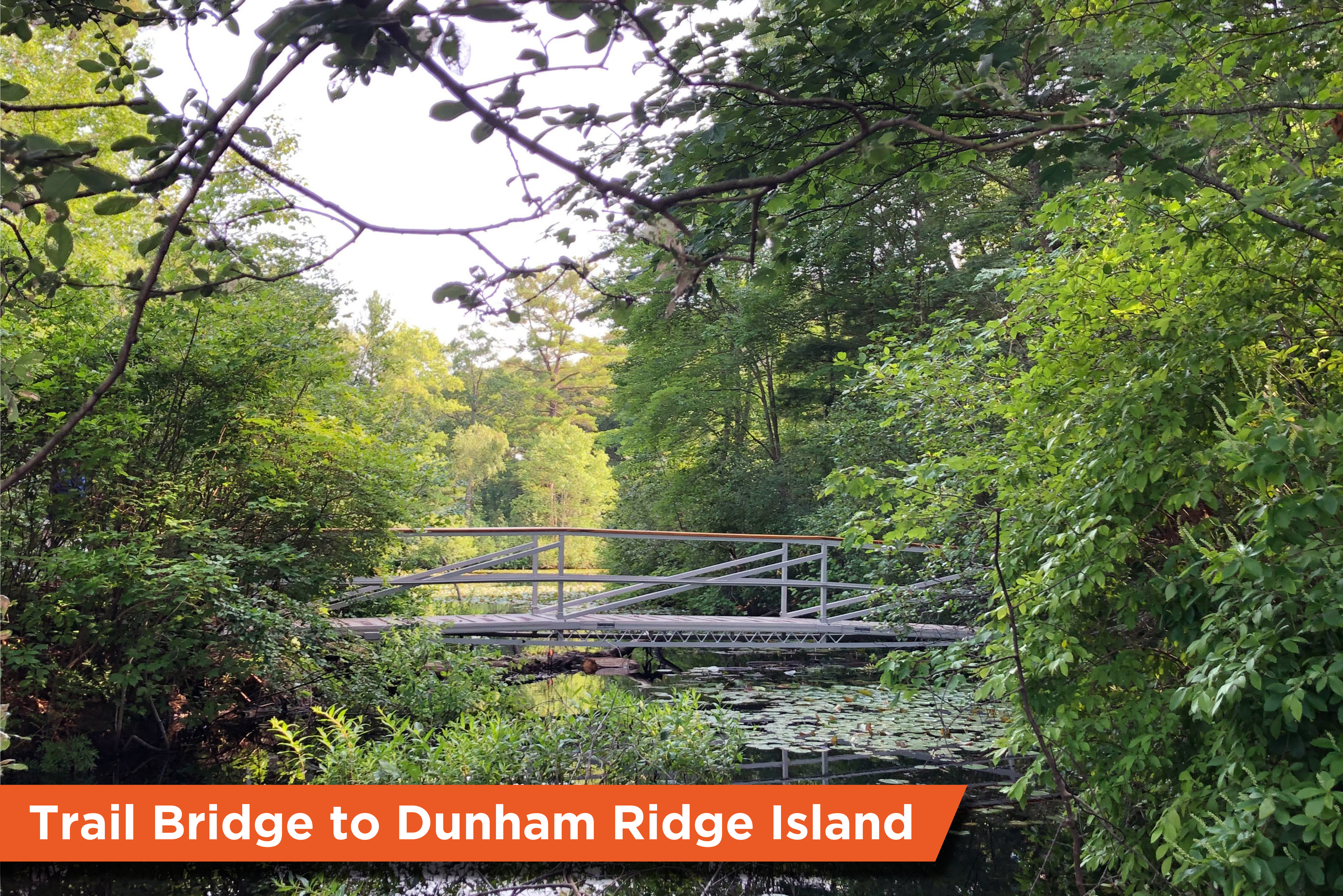
Trail Bridge to Dunham Ridge Island