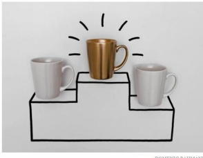
The 2017 Top Places to Work

Top Honors: Congratulations to client firms BankW Staffing , Bright Horizons Family Solutions and Systems & Technology Research on being named to Globe Magazine's Top Places to Work for 2017 .