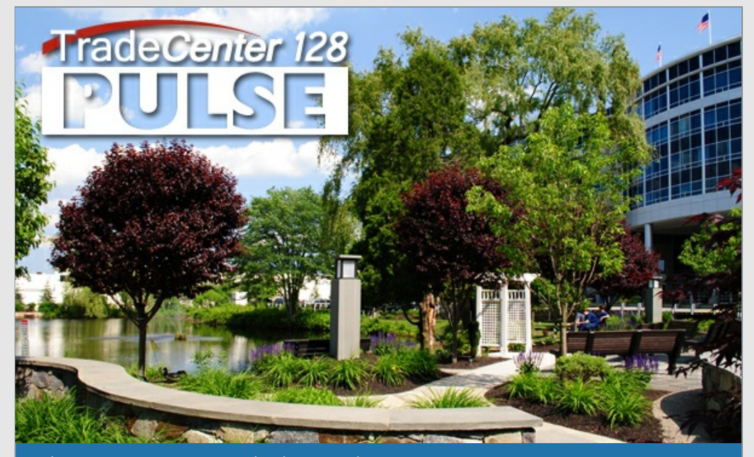
Client news, upcoming events, local news, and more