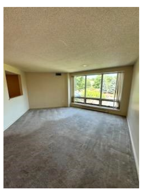
Address: 381 Place Lane, Woburn Monthly rent: $2,600