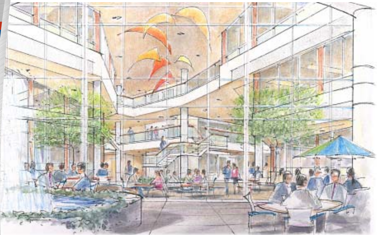
An upscale atrium restaurant in addition to a fitness facility, daycare, dry cleaner, convenience store, and bank are among the many planned lifestyle amenities located at TradeCenter 128.

A number of established corporations are in close proximity to TradeCenter 128: