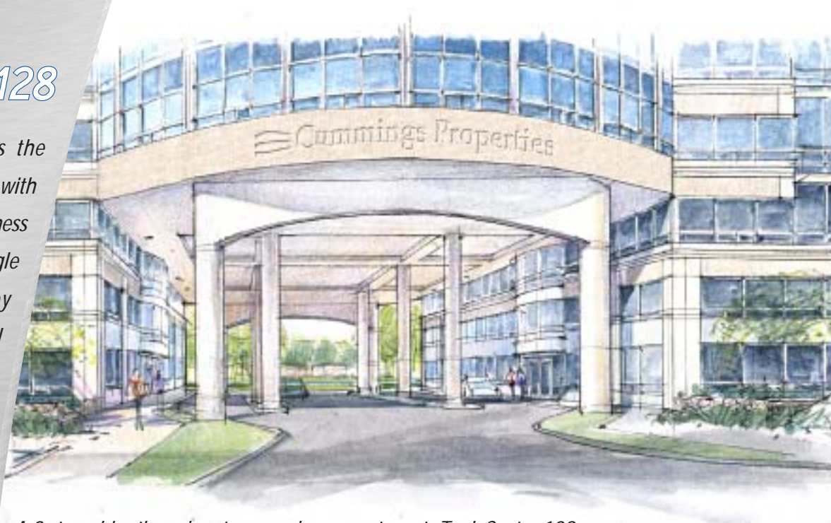
A 3-story drive-through gateway welcomes patrons to TradeCenter 128.

This flagship property offers the finest quality corporate lifestyle with the amenities of a central business district. It is the largest single building ever developed by Cummings Properties and will receive the best of our nearly 40 years of experience.