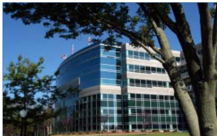
A closer perspective from the waterside of 500 Cummings Center

See reverse side for more details Visit us at 500cummingcenter.com