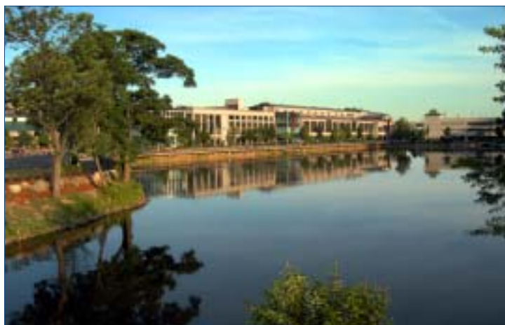
Treat yourself to any of the views from 500 Cummings Center