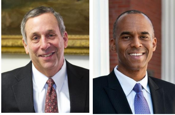
Dr. Larry Bacow