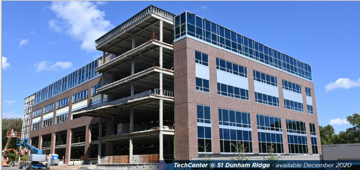
TechCenter @ 51 Dunham Ridge - available December 2020