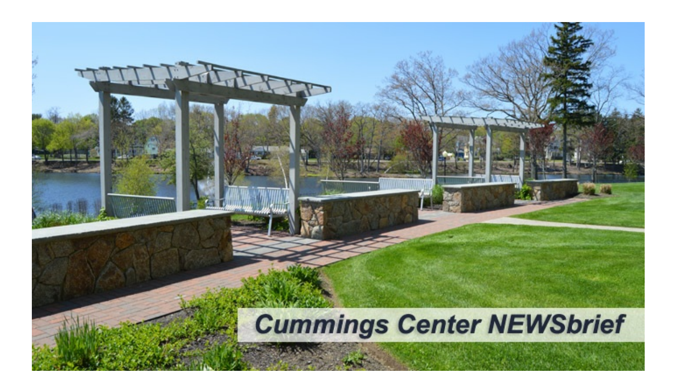
July 18, 2017